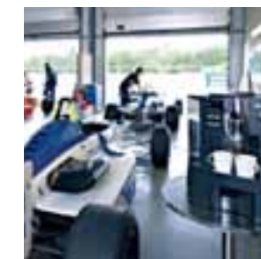
Flexibility of use