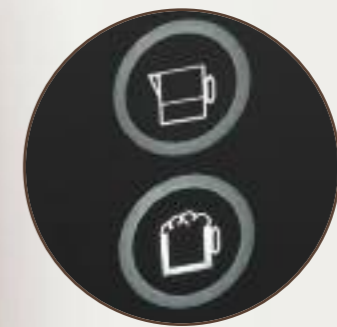
With a choice of different grades of milk foam and hot milk.