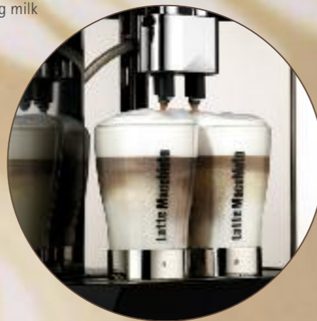
Perfect coffee specialities at the touch of a button

To heat large quantities of milk quickly, use the steam wand. The milk is automatically heated at the touch of a button until the programmable temperature sensor stops the process.